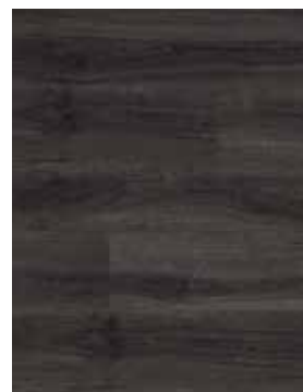
Pebble Beach OAT8841