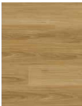
Native Blackbutt OAT9018