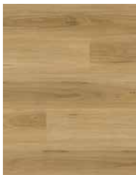
Sandy Blackbutt OAT7901