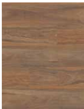
Spotted Gum OAT8283