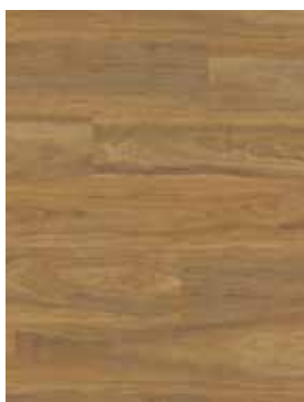
Spotted Gum NP529