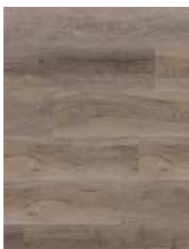
Light Driftwood NP524