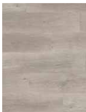
Ivory Grey NP521

Looking for matte finish floorboards in an extra-long format? Naturele Plank 5.0 is a collection of 10 versatile decors designed to add interest and a touch of luxury to your space. Enjoy a 100% waterproof surface, true-to-life detail and a softer feel underfoot with this Vinyl flooring collection. All designs are covered by a 25 Year Domestic Warranty and are suitable for both domestic and commercial installation.