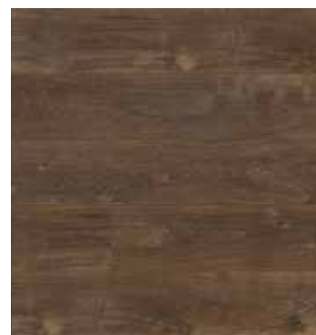
Forest Oak ADA128