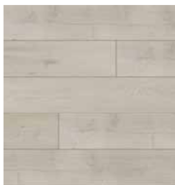
Polar Oak ADA122