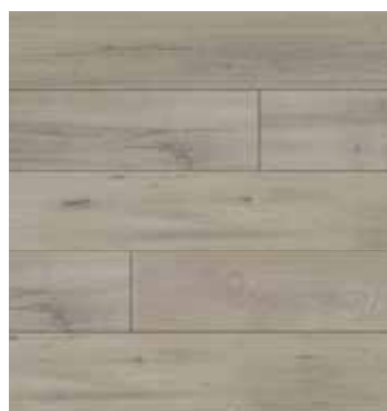
Camira Oak ADA123