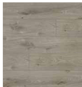
Sierra Oak ADA124