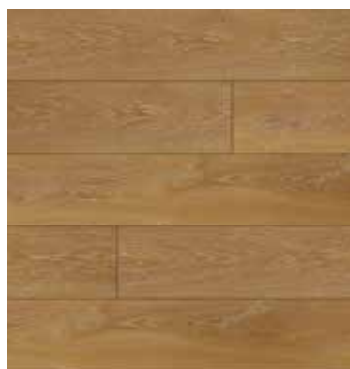
Caramel Oak ADA126