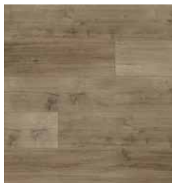
Frappe Oak ADA127