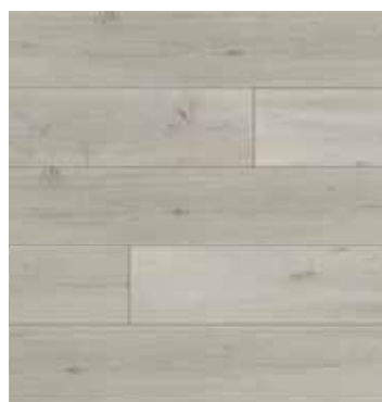
Arctic Oak ADA121

Offering eight gorgeous decors, the Adare collection of 12mm, extra-long Laminate floorboards can bring a stylish, modern feel to any home. With 72 hour spill protection and resistance to wear and stains these floors are suitable for installation throughout the home and a wonderful option for those with pets. They also feature an AC4 rating and superior UNICLIC ® locking system which is designed to improve floor performance as well as ease of installation. Plus, thanks to their embossed in register design, these floorboards feel as natural as they look.