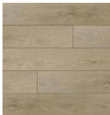
Dolce Oak ADA125