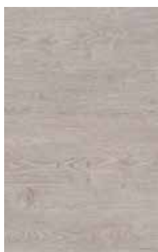
Dusk Oak NP302