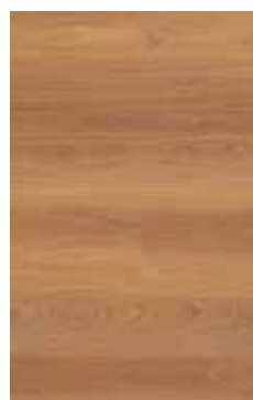
Coastal Blackbutt NP304