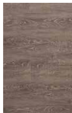
Fossil Oak NP312