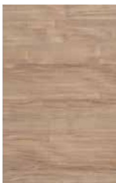
Limed Tallowood NP307