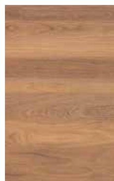
Qld Spotted Gum NP305