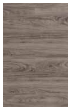
Pepper Grey Oak NP311