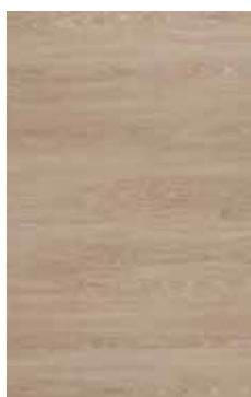
Sandy Oak NP301

Available in 12 gorgeous décor options, this collection is sure to have something to suit your needs. With a phthalate free and low VOC construction, these floors also feature a 25 Year Domestic Warranty.