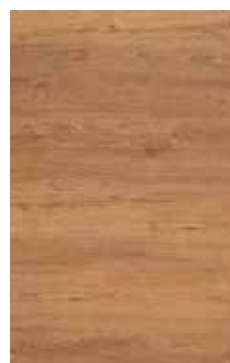
Golden Oak NP306