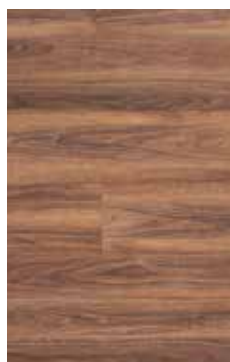
Smoked Hickory NP309