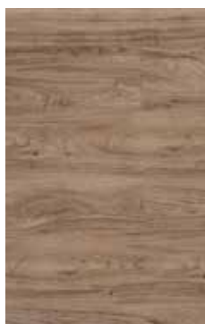
Autumn Washed Oak NP308