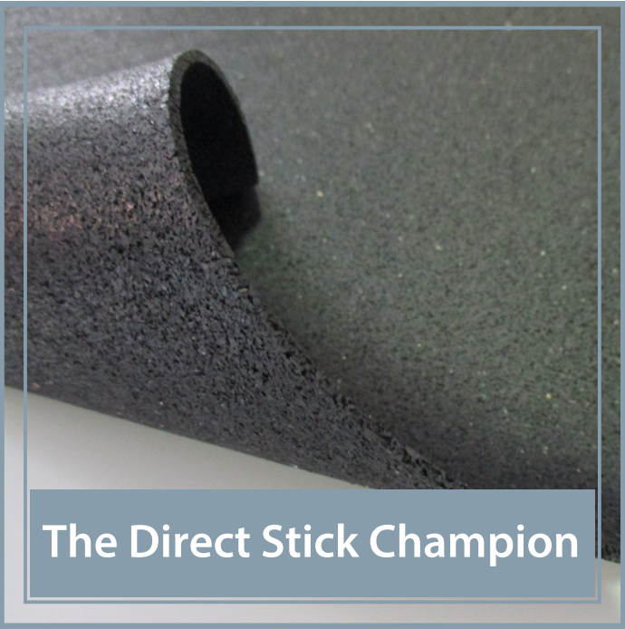
The Direct Stick Champion

Acoustalay achieves a 5 star acoustic rating when paired with 14/3mm Timber flooring. This rating far exceeds the minimum compliance. Acoustics should be measured in-situ to provide an accurate rating, as there are many factors that impact the overall score.