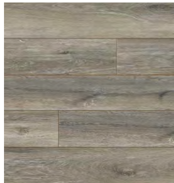
Shadow Oak KEE807