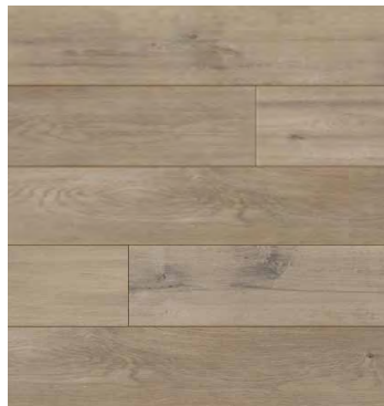
Weathered Espresso Oak KEE806