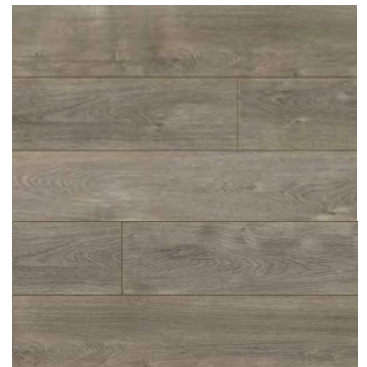
Sorrel Oak KEE808