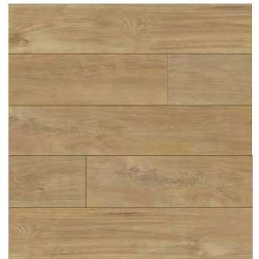
Honey Oak KEE804