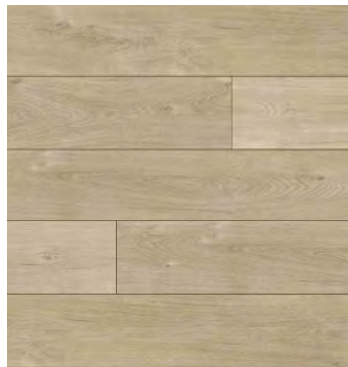
Crema Oak KEE802