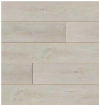
Frosted Oak KEE801

Fresh styles and eight stunning decors underpin the Keeta collection of Laminate floors. A low maintenance construction ensures they're well prepared to deal with everyday life and you'll enjoy easier installation and enhanced stability thanks to the superior UNICLIC® locking system. You will also love the way your new Keeta floors feel, as an embossed in register design ensure that they don't just look natural, they feel it too. Plus, 72 hour spill protection means you can install the range with confidence, while resistance to general wear and tear and an AC4 rating makes Keeta an ideal choice for those who have pets.