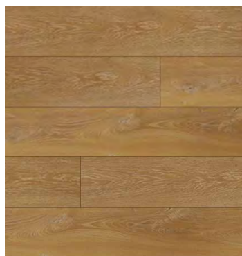
Caramel Oak ADA126