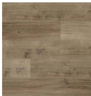
Frappe Oak ADA127