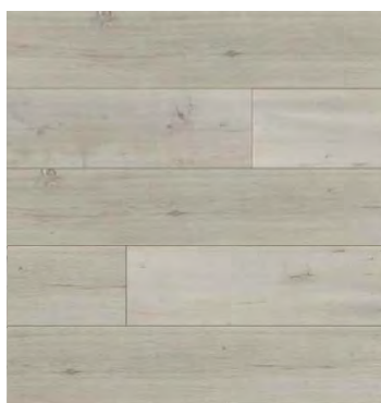
Arctic Oak ADA121

Offering eight gorgeous decors, the Adare collection of 12mm, extra-long Laminate floorboards can bring a stylish, modern feel to any home. With 72 hour spill protection and resistance to wear and stains these floors are suitable for installation throughout the home and a wonderful option for those with pets. They also feature an AC4 rating and superior UNICLIC® locking system which is designed to improve floor performance as well as ease of installation. Plus, thanks to their embossed in register design, these floorboards feel as natural as they look.