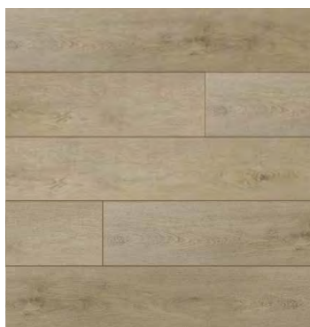
Dolce Oak ADA125