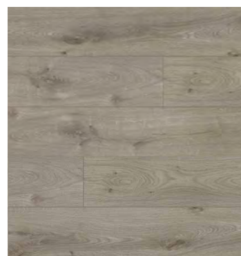
Sierra Oak ADA124