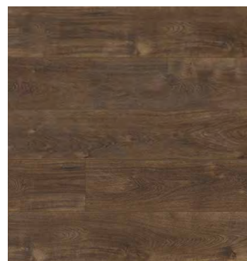
Forest Oak ADA128