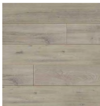
Camira Oak ADA123