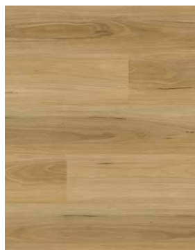
Sandy Blackbutt OAT7901