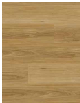
Native Blackbutt OAT9018