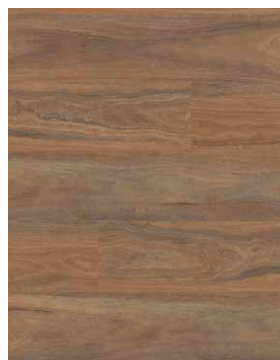
Spotted Gum OAT8283