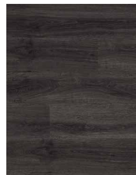
Pebble Beach OAT8841