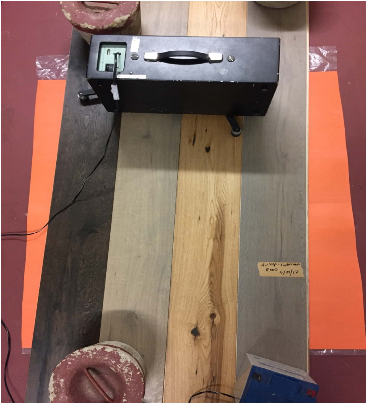
Figure 2. Setup of 'Timbermax' underlay with reclaimed Wild Oak floorboards.

The base floor (see Section 2.0) was tested to establish a reference performance of the floor/ceiling system from which the test sample is compared to. The test sample of 14 mm Reclaimed Wild Oak timber floorboards was laid on top of the 'Timbermax' underlay and setup on top of the base floor as shown in Figure 2 below.