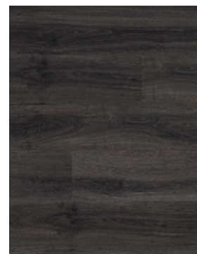
Pebble Beach OAT8841