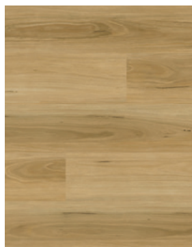
Sandy Blackbutt OAT7901