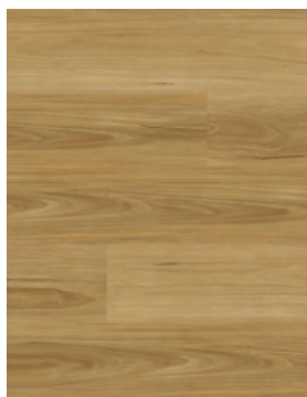
Native Blackbutt OAT9018