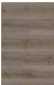
Gum Nut HYB008