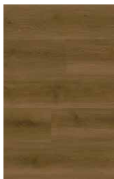
Smoky Topaz HYB010