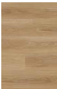
New England Blackbutt HYB002