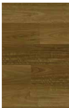
NSW Spotted Gum HYB003