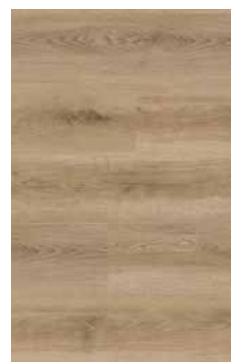
Desert Tan HYB006