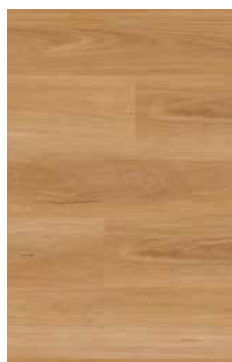
Coastal Blackbutt HYB001