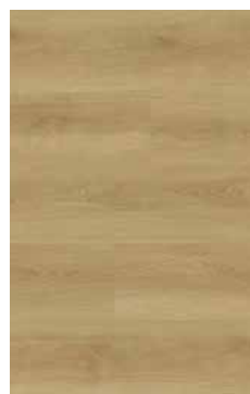
Harvest Beige HYB005