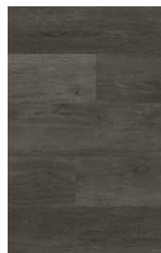
Burnt Ember HYB012