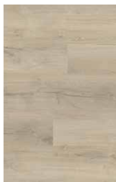
Coastal Mist HYB004