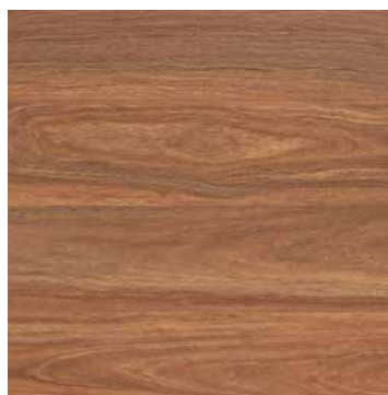
Spotted Gum OAT8283