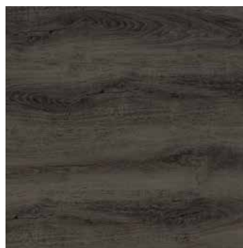
Pebble Beach OAT8841