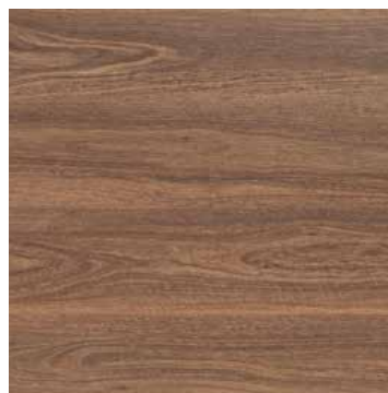
Grey Ironbark OAT9834