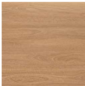
Mountain Ash OAT9836