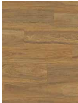
Spotted Gum NP529