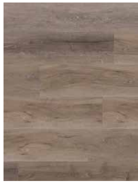
Light Driftwood NP524