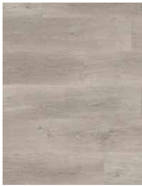
Ivory Grey NP521