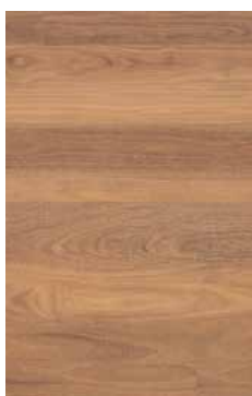
Qld Spotted Gum NP305