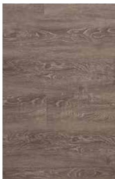
Fossil Oak NP312