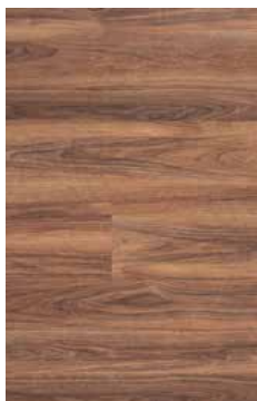
Smoked Hickory NP309