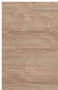
Limed Tallowwood NP307