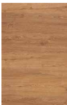
Golden Oak NP306