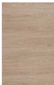
Sandy Oak NP301