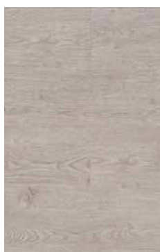
Dusk Oak NP302