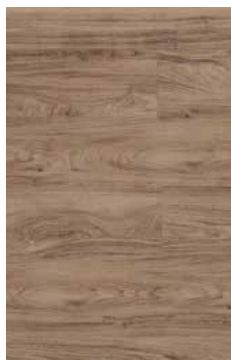
Autumn Washed Oak NP308