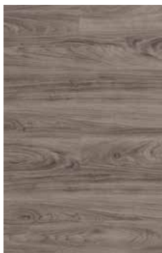
Pepper Grey Oak NP311