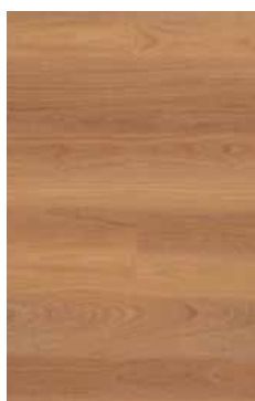
Coastal Blackbutt NP304