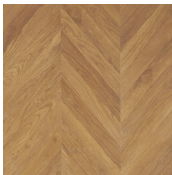
Natural Chevron MP173101