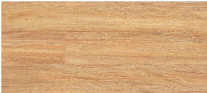
Tasmanian Oak ESG282