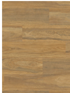
Spotted Gum NP529