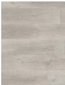
Ivory Grey NP521