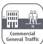
CLASS RATING 32