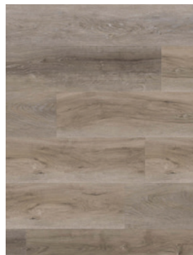
Light Driftwood NP524