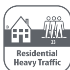
CLASS RATING 23