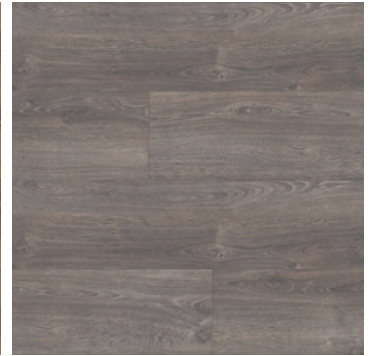
Nero Oak ED32923