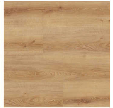
Candy Brown Oak ED32998