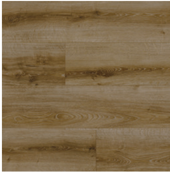
Natural Oak ED32963