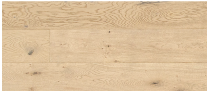
Drift Oak WE118