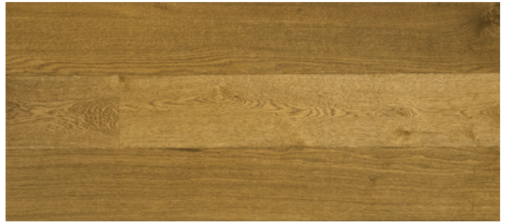
Golden Oak WE115