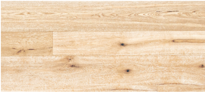
White Lacquered Natural Oak WE110