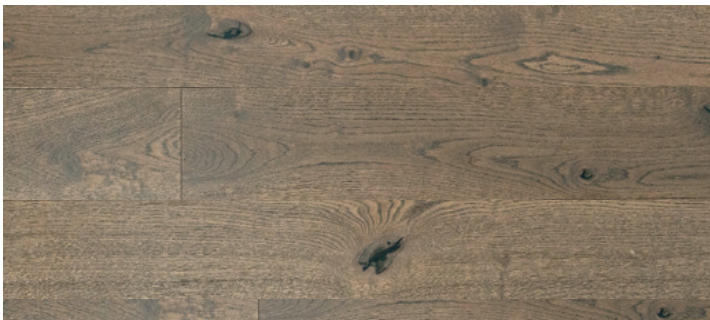
Mocha Oak WE117