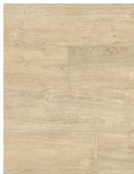
Chiaro Oak ED32922