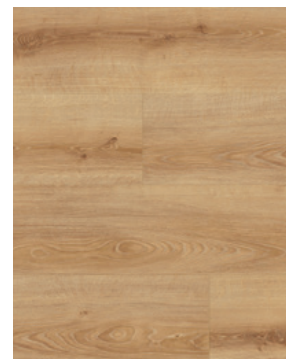
Candy Brown Oak ED32998