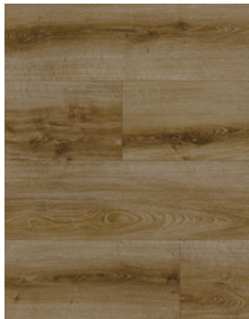
Natural Oak ED32963