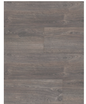
Nero Oak ED32923