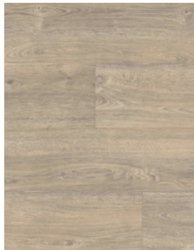
Grigio Oak ED32924