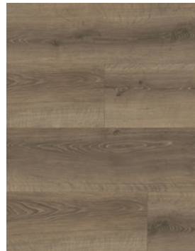
Anthracite Oak ED32961