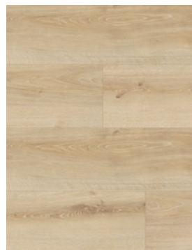
Ivory Oak ED32962