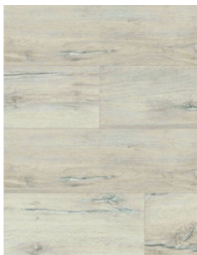
Old Oak Maremma ED35101