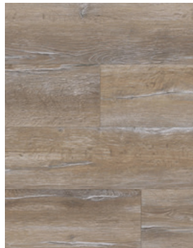
Old Oak Brown ED35100