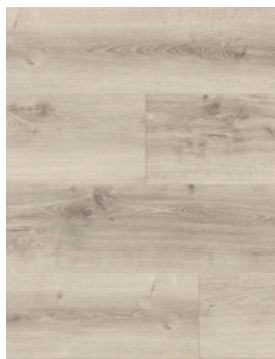
Alpine White Oak ED32960