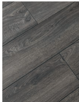
Nero Oak ED32923