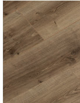
Natural Oak ED32963