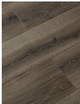
Anthracite Oak ED32961