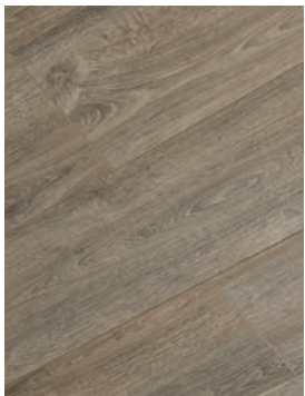
Grigio Oak ED32924