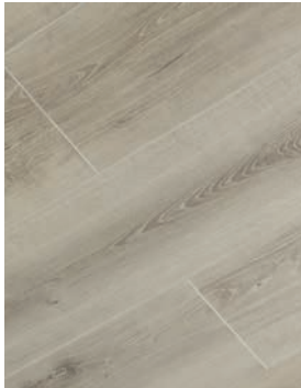
Alpine White Oak ED32960