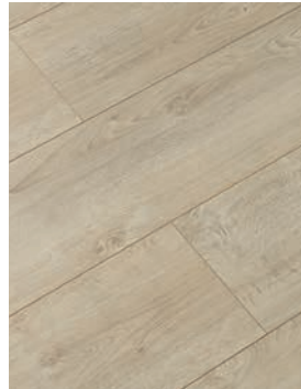
Chiaro Oak ED32922