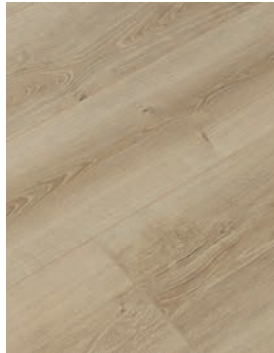
Ivory Oak ED32962