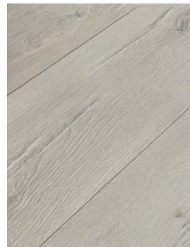
Old Oak Maremma ED35101