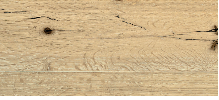
White Lacquered Natural Oak WE110