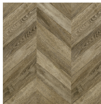
Classic Chevron MP176959