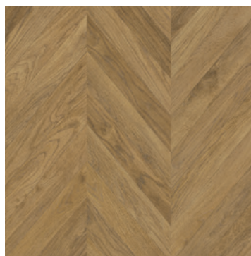
Natural Chevron MP173101