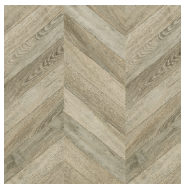
Chic Chevron MP176942