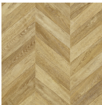
Boho Chevron MP176973