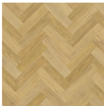
Natural Herringbone MP174276