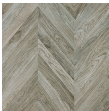
Grey Chevron MP174121