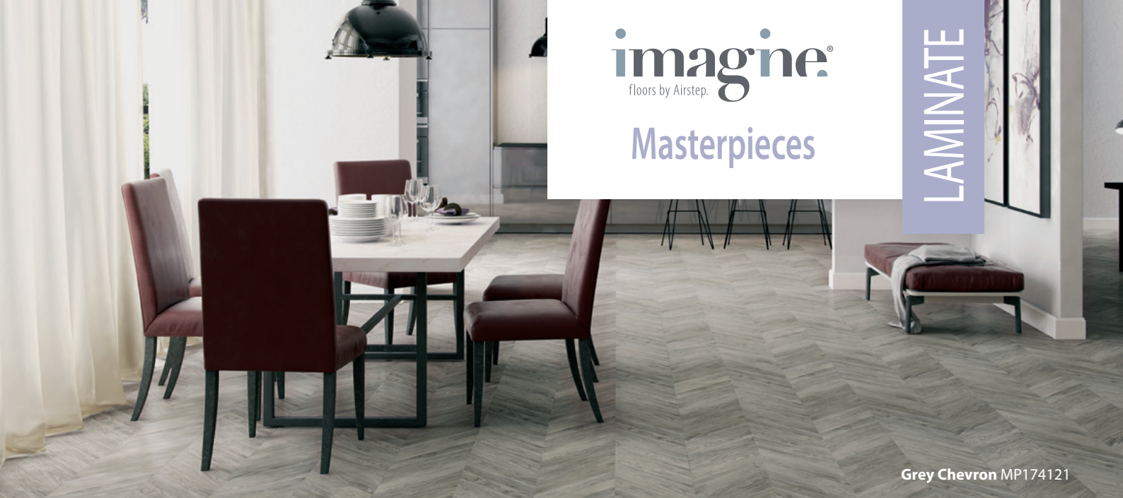
Grey Chevron MP174121