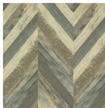
Noyer Chevron MP178731