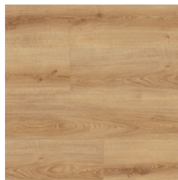
Candy Brown Oak ED32998