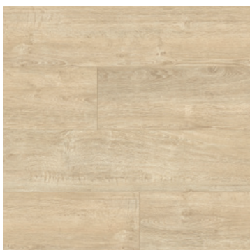
Chiario Oak ED32922