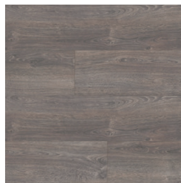
Nero Oak ED32923