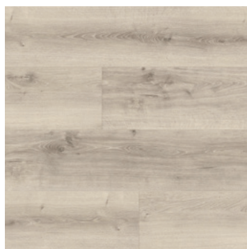
Alpine White Oak ED32960