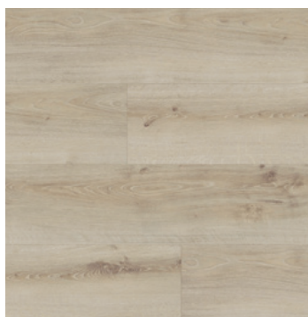
Ivory Oak ED32962