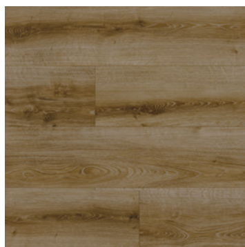
Natural Oak ED32963